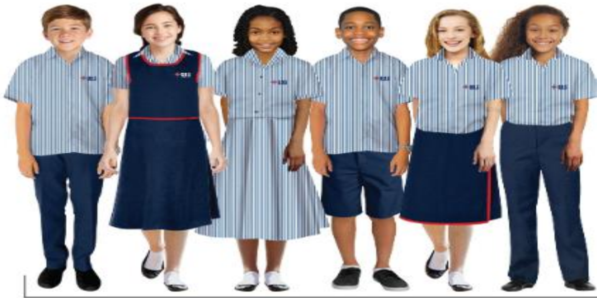
Year 1 - Year 6