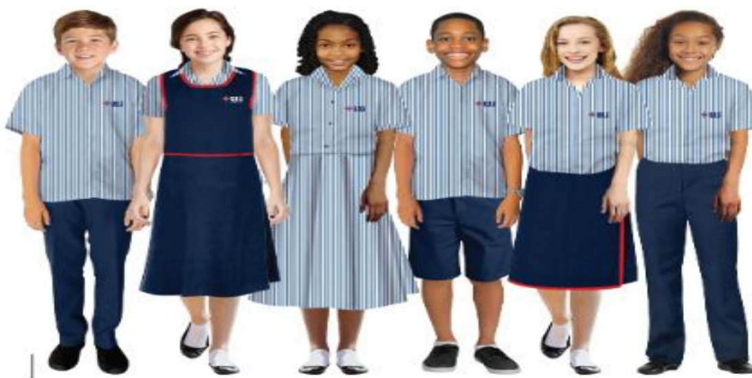
Year 1 - Year 6